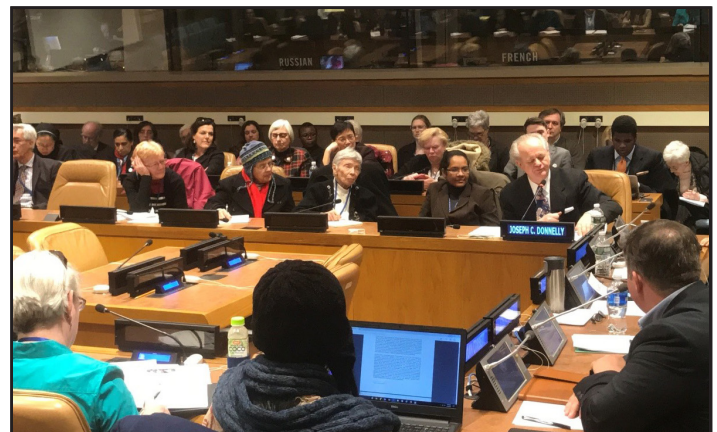
Participants and Panelists at Vincentian side event