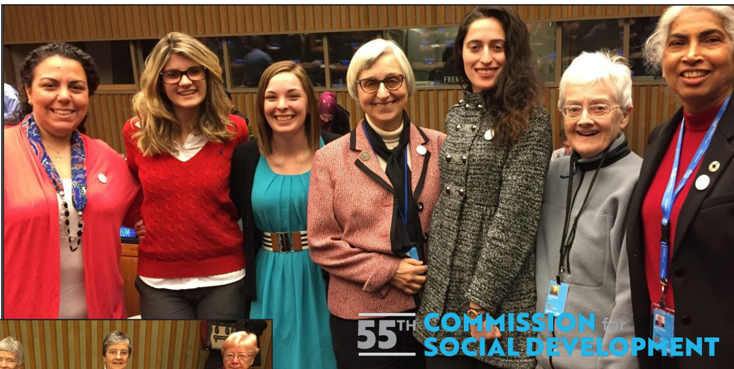
Federation Participation at the 55th Commission for Social Development